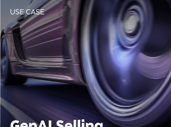
GenAl Selling Assistant: always-on digital consultant