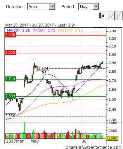
Chart INTESA SANPAOLO